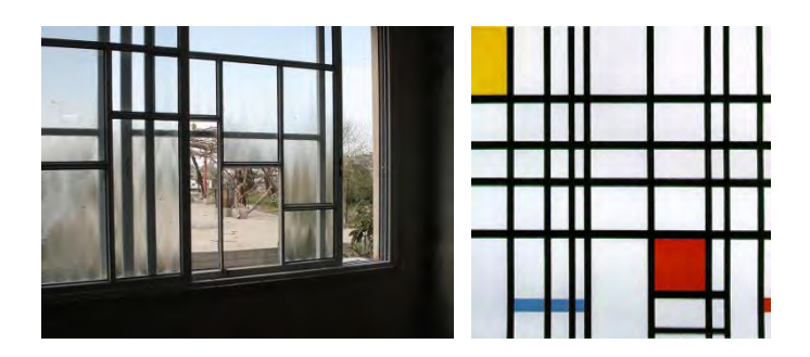
Figure 4: Horizontal and vertical lines, a typical aluminium window vs. a painting, homage to Mondrian.

Aesthetics of the raw material, the relationship of objects to actual space, the effects of natural light on street volumes, and producing highly reduced arrangements are available within the visual context in Gaza. The objects, frequently reduced to very simple geometric shapes, were industrially produced, thus removing the artist's personal signature from the work. The works were also characterised by serial arrangements of a number of shapes in small and medium dimensions. Freestanding objects; such as metallic tubes and wooden stacks can be seen laid at the streets of the Gaza Strip with their circular and rectangular ends being repeated in lines horizontally and vertically. Wooden pallets, stacks of plywood, rusty tubes, all this concentration on the formal aspects of the composition led to a close link with the sculptural works of minimal art. While watching the blacksmith at his workshop working metal with a hammer and anvil, and the carpenter working at his carpentry, one can see that they are making pieces of sculpture, keeping it