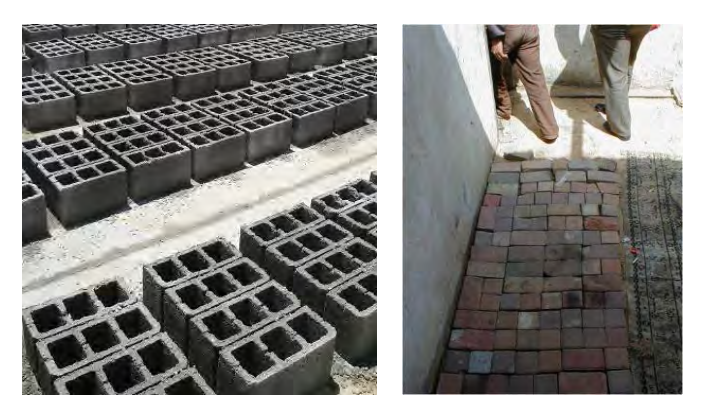
Figure 2: Similar to those grid formats of minimalist artist Carl Andre, a local arranged bricks at a particular manner.

People in the Gaza Strip have constantly been in the band of political instability. An ordinary citizen looked upon art only in terms of its utility (Fig. 2), and it was thus no accident that period primarily saw the development of applied arts. On the other hand, residential buildings in the Strip may look like disorganized groups of crowded grey concrete boxes. But when you start to look beneath their outer layers and begin to examine what's going on underneath you will find all sorts of complex and human life-support systems at work in those dwellings, in which the prominent note is resourcefulness, not hopelessness [4].