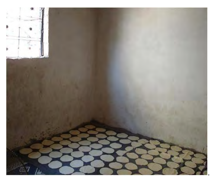
Figure 3: Dough circles repeated in rows and columns inside a poor local house, the Gaza strip.

For example, ordinary Palestinian women in the Gaza Strip prepare traditional flat bread for their families using wheat flour they got from humanitarian aid agencies. Baking bread at home saves hundreds of shekels on groceries every year. Fresh-baked bread is prepared every day in some houses. Similar to the basics of minimal art, women lay dough of clean circular surfaces and repeat the pieces of dough in rows and columns.